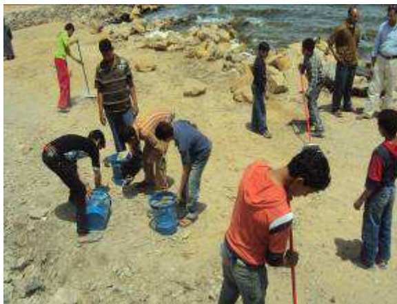
Safe disposal of solid waste component