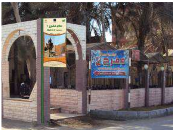
Component of Coordination of civilization