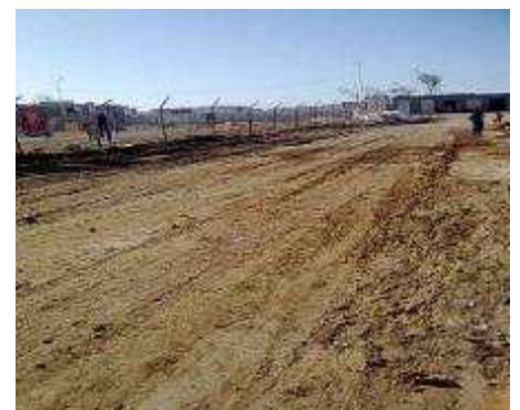
The road after