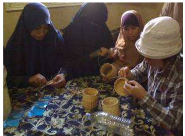
Training component on the crafts