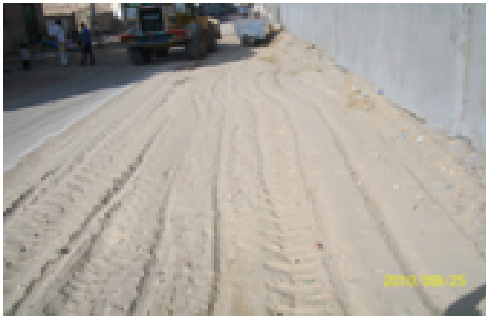
road during cleaning

The team work of the project contributed in developing an effective strategy for sustaining the cleaning process inside the streets and the corridors of the village, In order to show the proper manner that fits the importance of tourism and historical place which works with all activities of the project to recapture this position.