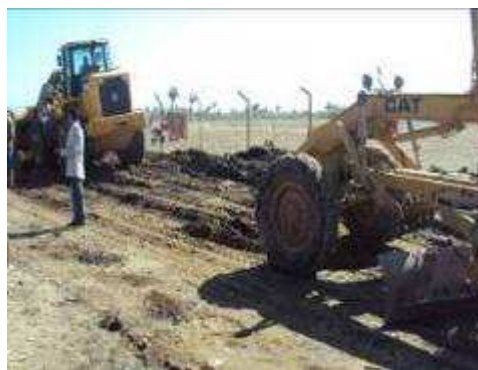
The road during cleaning