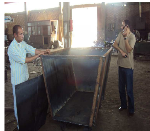
Containers during the manufacturing containers during amendment Delivery of containers to village and community official s: